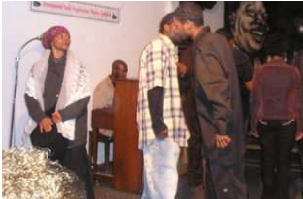
Dr. "MLK" stops corpsmember in their tracks as he expounds on his struggles.

The play posits what if Dr. Martin Luther King, civil rights leader and Harriet Tubman "conductor" on the Under Ground Rail Road (UGRR) could come back and share the meaning of each of their struggles, with a group of