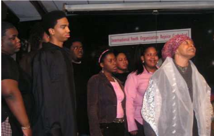
Corpsmembers watch in rapt attention as "Harriet Tubman" recounts her travails.